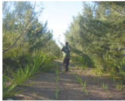
Reforested dune planted by ALT in 2002